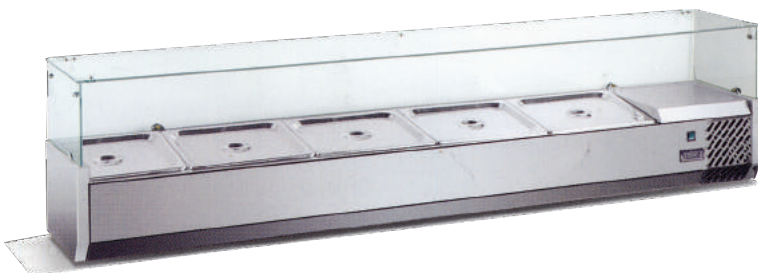
CODE: CF/185 SALAD SHOWCASE

Model: SG3 Volume Cu.Ft (L): 19Cu.Ft (510L) Doors: 3 Temperature: 0°C ~ 10°C Cooling System: Ventilated Controller Type: Digital Size (WDH): 2002x520x860mm