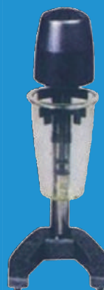
CODE: CT/147 1 HEAD MILK SHAKER

Model: SD-F4 Power: 100W Voltage: 220V Capacity: 1Lt Size: (175x195x480)mm