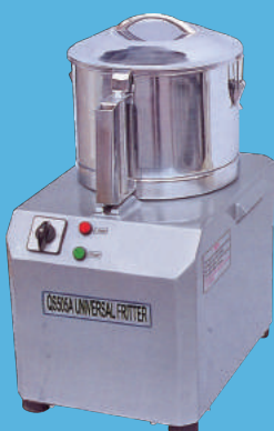
CODE: CT/279 VEGETABLE SLICER 13LTS STAINLESS STEEL

Model: TYZ-8 Power: 550W Voltage: 220V Productivity: 200~300Kg/h Size: (450x450x480)mm