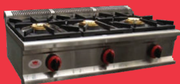
CODE: CT/361 TABLE TOP 3 BURNER COOKER

Burner: 2 Type: LPG gas valve Pan Strong & durable Support: Size: 660x490x360mm