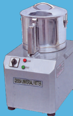
CODE: CT/202 1 BLADE VEGETABLE SLICER 5LTS STAINLESS STEEL

Model: QS503A Power: 0.65KW Voltage: 220V Capacity: 13 Lts Size: (230x300x480)mm