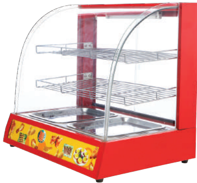
CODE: CT/366 PIE WARMER

The upper & lower layers can be equipped with orbit-rack or food-tray, special for displaying hamburgers and fried chickens.