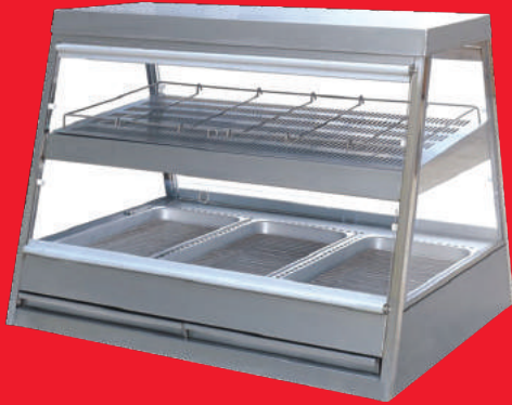
CODE: CT/324 HOT FOOD DISPLAY WARMER

Keep warm & humidity, even temperature, two sides with heat resistance glass.