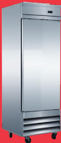
CODE: CF/103 SINGLE DOOR S/STEEL FREEZER 25CU.FT