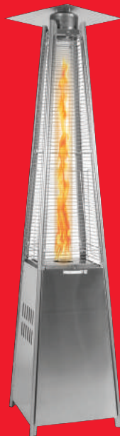
CODE: RG/536 OUTDOOR GAS HEATER