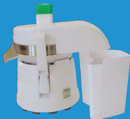
CODE: CT/117 HEAVY DUTY JUICER

2200W motor Variable speed, pulse function control High quality stainless steel blades High quality durable polycarbonate jar 2.8Lts Special fruit & vegetable chopping function Speed - 3000rpm