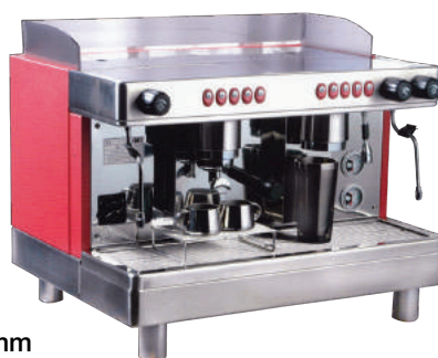
CODE: CT/451 CAPPUCCINO MACHINE 2 GROUP

Model: T2 Colour: Brown Power: 4000W Voltage: 220V Frequency: 50Hz Size: (700x540x550)mm