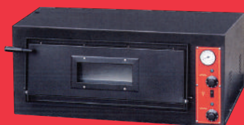
CODE: CT/232 SINGLE DECK PIZZA OVEN

Capacity: 12" pizza x 2pcs Voltage: 220-240V Power: 2.4KW Temperature: 0~350°C Dimension: 585x550x430mm Chamber: 400x400x115mmx2Pcs