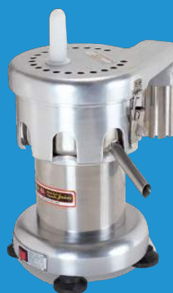
CODE: CT/183 HEAVY DUTY JUICER

Model: M-4000 Power: 0.18KW Voltage: 220V Speed: 6500 rpm Size: (240x220x380)mm