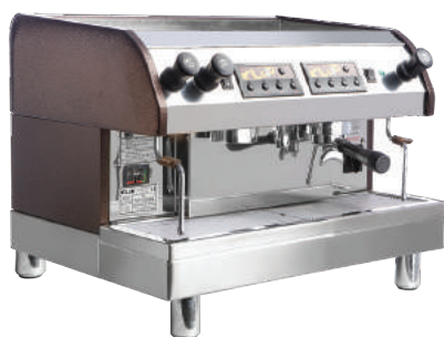
CODE: CT/450 CAPPUCCINO MACHINE 2 GROUP

Model: T2 Colour: Brown Power: 4000W Voltage: 220V Frequency: 50Hz Size: (700x540x550)mm