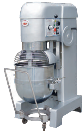
CODE: CT/204 FOOD MIXER 60LTS

Power: 26KW Voltage: 380V No. of trays: 11 Size of tray: (635x533x51)mm Trays distance: 127mm Size: (1200x1920x2170)mm Production: 60 Loaves at a time Capacity: Temperature: 0°C - 300°C