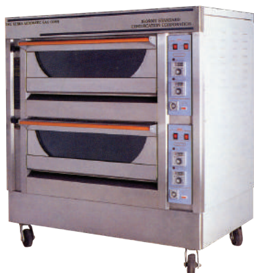
CODE: CT/277 GAS OVEN DOUBLE DECK

Model: GR4 Power: 0.2KW Voltage: 220-240V Gas Pressure: 2.8Kpa Heat Load: 90Mj/Hr Size: (1355x800x1410)mm