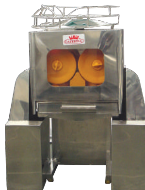
CODE: CT/288 CONTINUOUS ORANGE JUICER

Model: WF-B2000 Power: 500W Voltage: 220V Speed: 2800rpm