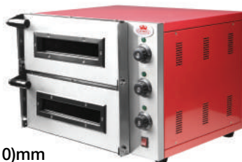
CODE: CT/358 2 DECK PIZZA OVEN

Model: GR4 Power: 0.2KW Voltage: 220-240V Gas Pressure: 2.8Kpa Heat Load: 90Mj/Hr Size: (1355x800x1410)mm