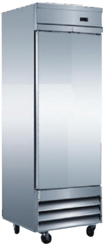
CODE: CF/101 SINGLE DOOR S/STEEL FRIDGE 25CU.FT