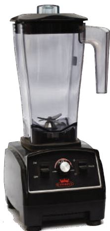
CODE: CT/405 COMMERCIAL BLENDER 2200W

2200W motor Variable speed, pulse function control High quality stainless steel blades High quality durable polycarbonate jar 2.8Lts Special fruit & vegetable chopping function Speed - 3000rpm