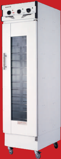
CODE: CT/213 PROVER

Model: B60 Power: 2.8KW Voltage: 380V Bowl volume: 60Lts Size: (590x580x1130)mm Kneading capacity: 20Kgs Mixing Speed: 109/216 r/min