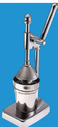
CODE: CT/286 MANUAL ORANGE/LEMON JUICER

Power: 0.37KW Voltage: 220V Frequency: 50Hz Size: (230x230x410)mm