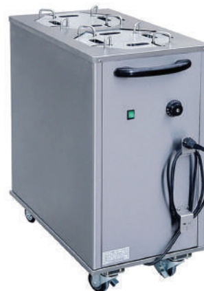
CODE: CT/332 PLATE WARMER 2x75