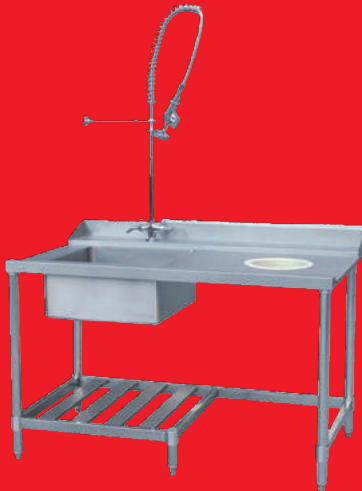
CODE: CT/340 DISH WASHER PRE-CLEANING TABLE