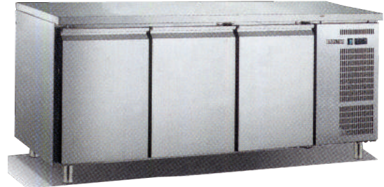
CODE: CF/165 STAINLESS STEEL UNDER COUNTER CHILLER 3 DOORS

Model: TG14 Volume Cu.Ft (L): 13Cu.Ft (318L) Doors: 2 Temperature: 0°C ~ +10°C Refrigerant: R134a Size (WDH): 1400x700x850mm