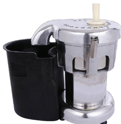
CODE: CT/322 HEAVY DUTY CARROT JUICER

Model: 1000JP Power: 450W Voltage: 220V Size: (400x260x350)mm