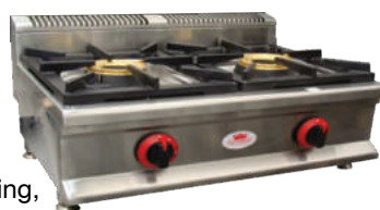
CODE: CT/360 TABLE TOP 2 BURNER COOKER

Effectively designed for multi-tasking, such as frying, boiling, grilling and simmering