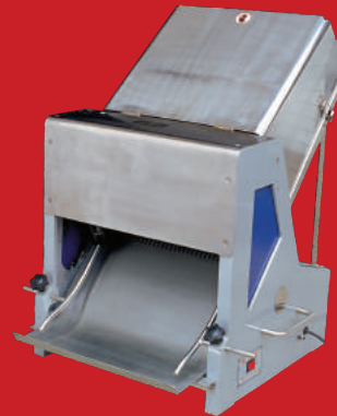
CODE: CT/169 BREAD SLICER

Model: FX-13A Power: 2.7KW Voltage: 220V Standard pans: 13 Pcs Size: (500x710x1740)mm