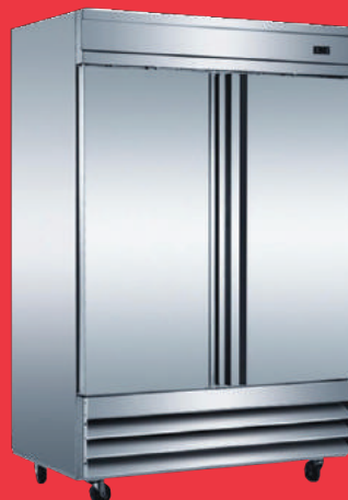
CODE: CF/104 DOUBLE DOOR S/STEEL FREEZER 50CU.FT