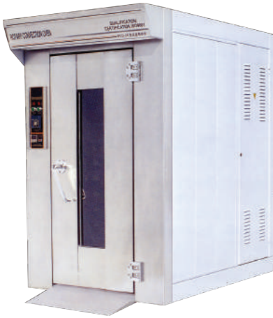
CODE: CT/216 ROTARY ELECTRIC OVEN

Power: 26KW Voltage: 380V No. of trays: 11 Size of tray: (635x533x51)mm Trays distance: 127mm Size: (1200x1920x2170)mm Production: 60 Loaves at a time Capacity: Temperature: 0°C - 300°C