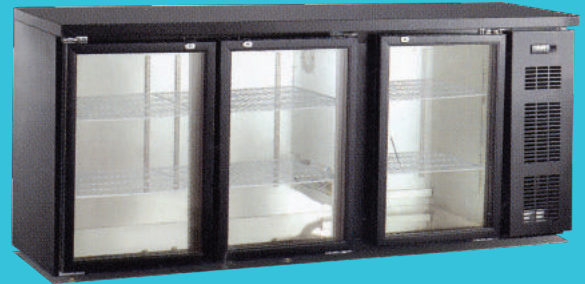
CODE: CF/175 GLASS DOOR UNDER COUNTER CHILLER 3 DOOR

Model: SG2 Volume Cu.Ft (L): 13Cu.Ft (340L) Doors: 2 Temperature: 0°C ~ 10°C Cooling System: Ventilated Controller Type: Digital Size (WDH): 1462x520x860mm