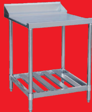
CODE: CT/341 DISH WASHER EXIT TABLE