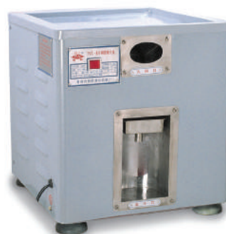
CODE: CT/186 COMPACT SUGARCANE PRESS STAINLESS STEEL BODY

Model: YZ-28B Power: 550W Voltage: 220V Productivity: 200~300Kg/h Size: (520x550x920)mm