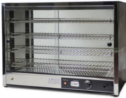
CODE: CT/323 HOT SNACK DISPLAY WARMER

Power: 1Kw Volts: 220-240V Size: (640x360x530)mm