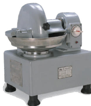
CODE: CT/227 FINE CUTTER

Model: TR-21 Power: 250W Voltage: 220V Productivity: 120Kg/h Size: (230x440x400)mm