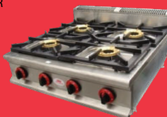
CODE: CT/362 TABLE TOP 4 BURNER COOKER

Burner: 3 Type: LPG gas valve Pan Strong & durable Support: Size: 900x490x360mm