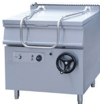
CODE: CT/326 TILTING BRAISING PAN MULTI TASKING Power: 80778 BTU/Hr Capacity: 80Lts Size: 800x900x850+120 mm

Model: EP-01-2 Power: 14.4KW Voltage: 380V Temperature: 50°C – 300°C Size: (890x1100x745) mm