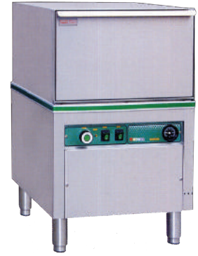
CODE: CT/330 GLASS WASHER

Water pump and microcomputer control circuit from famous international suppliers. The wash temperature is showed in time. it is the perfect choice for your bar, cafe or coffee lounge. Simply select the desired wash cycle time