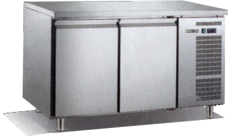
CODE: CF/164 STAINLESS STEEL UNDER COUNTER CHILLER 2 DOORS

Model: TG14 Volume Cu.Ft (L): 13Cu.Ft (318L) Doors: 2 Temperature: 0°C ~ +10°C Refrigerant: R134a Size (WDH): 1400x700x850mm