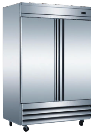
CODE: CF/102 DOUBLE DOOR S/STEEL FRIDGE 50CU.FT