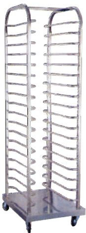
CODE: CT/242 STEEL SHELF RACK

Power: 0.43KW. Slicing thickness: 12mm. Pieces/time: 30. Size: (650x740x750)mm. Production capacity: 200 - 350 Loaves per hour