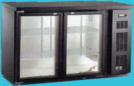
CODE: CF/174 GLASS DOOR UNDER COUNTER CHILLER 2 DOOR

Model: TG18 Volume Cu.Ft (L): 19Cu.Ft (497L) Doors: 3 Temperature: 0°C ~ +10°C Refrigerant: R134a Size (WDH): 1875x700x850mm