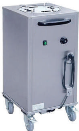
CODE: CT/331 PLATE WARMER 1x75