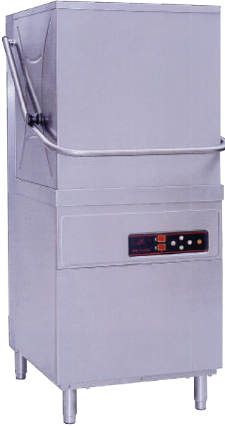
CODE: CT/329 DISH WASHER