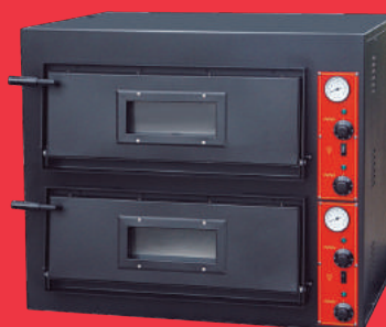
CODE: CT/231 DOUBLE DECK PIZZA OVEN

Model: EP-01-1 Power: 7.2KW Voltage: 380V Temperature: 50°C – 300°C Size: (890x1100x430)mm