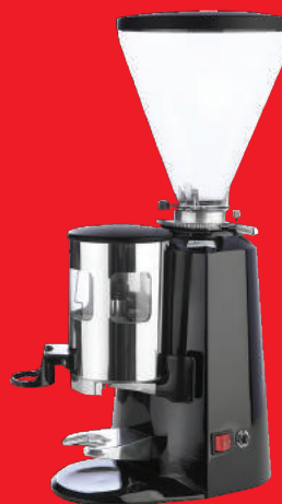
CODE: CT/452 PROFESSIONAL COFFEE GRINDER

Boil water, spray coffee powder and filter coffee automatically.