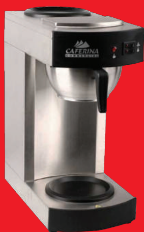
CODE: CT/325 COFFEE MAKER/WARMER

Model: N2 Colour: S/Steel Power: 4000W Voltage: 220V Frequency: 50Hz Size: (700x540x590)mm