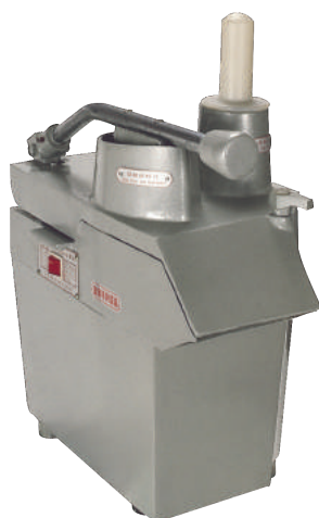
CODE: CT/188 VEGETABLE CUTTER+FRUIT PRESS 5 BLADES # S/STEEL

Model: Q505 Power: 1.5KW Voltage: 220V Capacity: 5 Lts Size: (305x380x530)mm