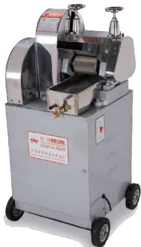
CODE: CT/167 SUGARCANE PRESS MACHINE 60KG

Model: YZ-28B Power: 550W Voltage: 220V Productivity: 200~300Kg/h Size: (520x550x920)mm